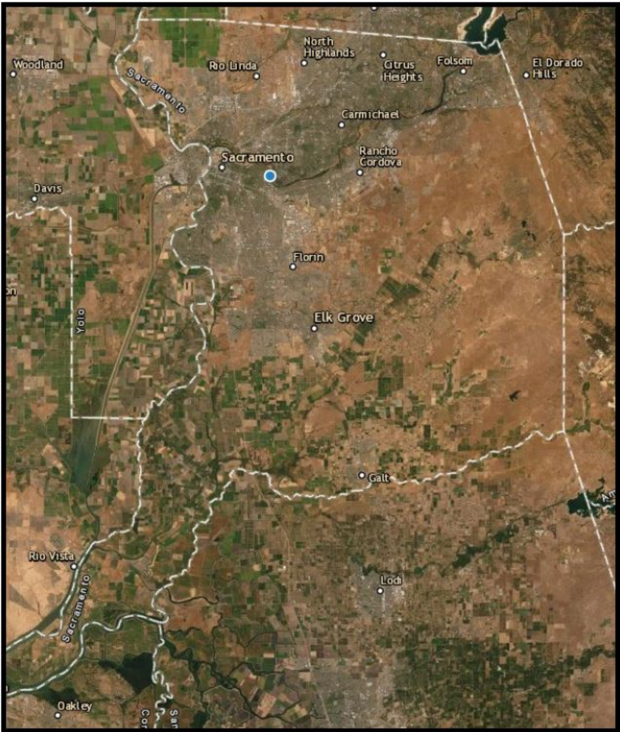
1) Vicinity map